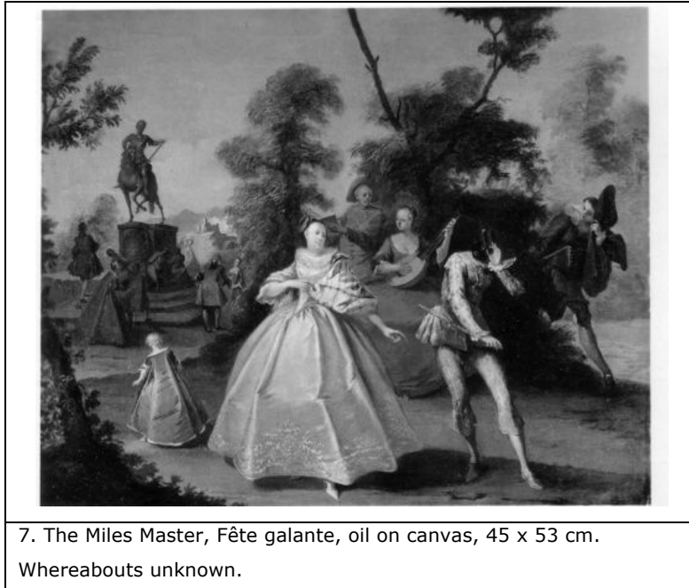
7. The Miles Master, Fête galante , oil on canvas, 45 x 53 cm. Whereabouts unknown.

A fourth picture by the Miles Master was sold in a Cologne auction in 1978, this time given to the circle of Lancret (fig. 7). 7 Here again, the principal dancer leans to the left while Harlequin leans to the right. The child at the left also has a distinctive, unexplained cant, but most bizarre of all is the man at the far right who steps out from behind shrubbery on rubbery legs that seem disassociated from his body.