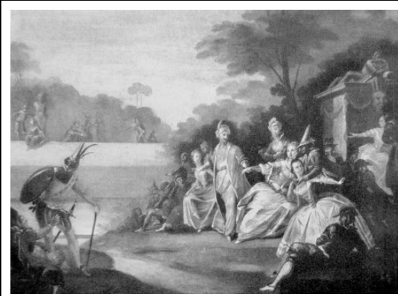
10. The Miles Master, Fête galante with Masked Figures , oil on canvas, 64 x 80 cm. Whereabouts unknown.