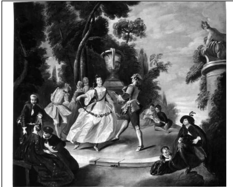
5. The Miles Master, Fête galante , oil on canvas, 79 x 95 cm. Whereabouts unknown.

specific artist. Yet, as will be seen, one man was responsible for all of them. To give appropriate coherence to this otherwise unidentified painter's oeuvre, I have chosen to name him, faute de mieux , "The Miles Master."