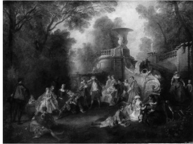
13. Nicolas Lancret, A Game of Blind Man's Bluff , oil on canvas, 97.3 x 129.1 cm. Potsdam, Stiftung Preussische Schlösser und Gärten, Schloss Sans-Souci.

These eight paintings share a unity of approach and execution. They reveal the general influence of French rococo painting, not so much from Watteau as from Pater, Lancret, and that generation of Watteau's so-called satellites. The Miles Master's awkward poses reflect the animated gestures frequently encountered in the works of Pater and Lancret, but whereas in a typical Pater such as The Dance in The Wallace Collection (fig. 12), the figures move gracefully and convincingly, comparable gestures in the Miles Master's works are exaggerated and awkward. The Miles Master's preference for tall, curving garden walls, often adorned with urns set on high, has much in common with Lancret's compositions, such as his Blind Man's Bluff in Potsdam (fig. 13). And Lancret's centrifugal depiction of that game seems to anticipate the formula attempted by the Miles Master (fig. 6). In short, the features seen in these fêtes galantes invalidate the possibility of the early 1715-16 date proposed by Ingamells and Raines for Roy Miles' painting. The Miles Master did not anticipate Watteau's mature works (an improbable assertion in the first place) but, instead, registered the impact of the second