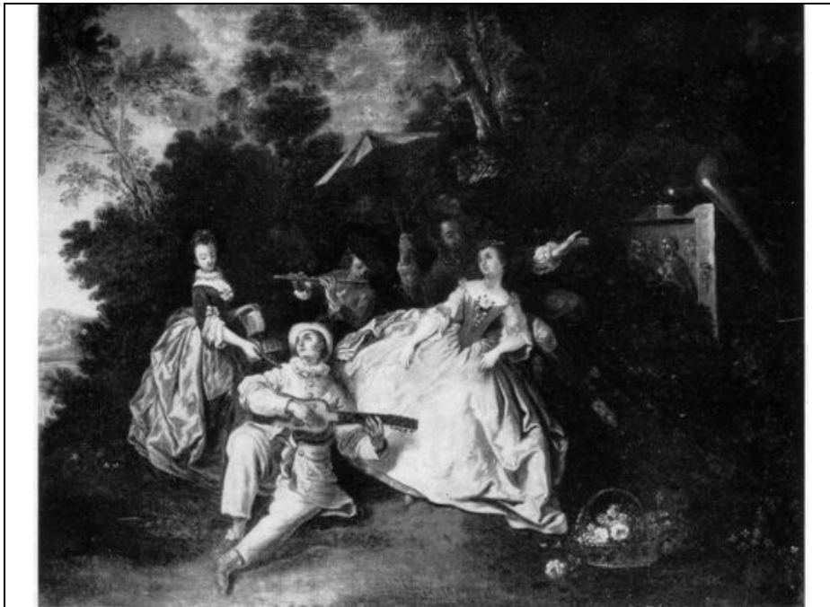
9. The Miles Master, Fête galante , oil on canvas, 65 x 81 cm. Whereabouts unknown.

A scene with music-making that came onto the French market in 1964 has all the by-now familiar syndromes (fig. 9). 9 The exaggerated, doll-like proportion of the characters, the awkward positions of limbs, and the dull, expressionless faces betray the Miles Master. Although the painting was attributed to Pater when it was offered at auction, it obviously has nothing to do with him.