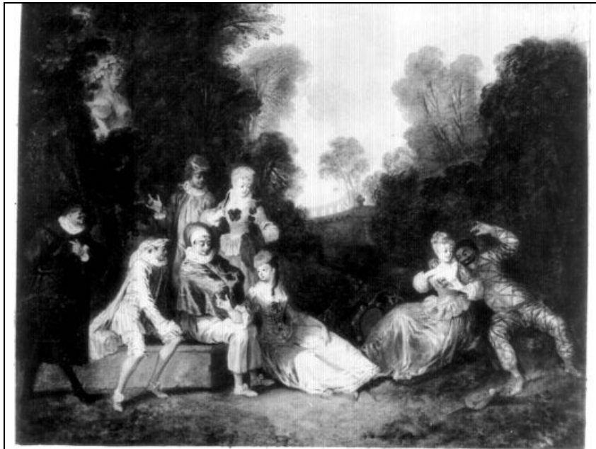
3. Philippe Mercier, Fête galante , oil on canvas, 47 x 55 cm. Whereabouts unknown (formerly New York, Newhouse Galleries).