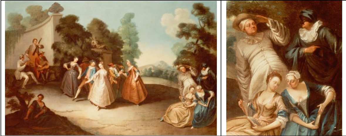
1. The Miles Master, Fête galante , oil on canvas, 99.1 x 156.1 cm. Whereabouts unknown (formerly London, Roy Miles collection).