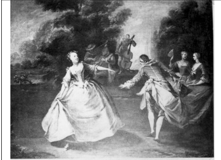
8. The Miles Master, Fête galante , oil on canvas, 40.6 x 51.5 cm. Whereabouts unknown.

Yet another painting wrongly attributed to Lancret but assignable to the Miles Master was on the New York market in the 1970s (fig. 8). 8 The inclined stance of the female dancer seems par for the course, but the posture of her male partner is even more remarkable: his legs are not aligned with the angle of his torso. The bland face of the woman and the curiously warped faces of the two women at the right are recurring characteristics in the work of the Miles Master.