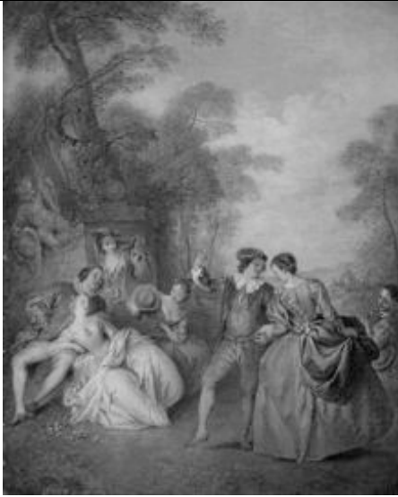
12. Jean Baptiste Pater, The Dance , oil on canvas, 56.7 x 45.7 cm. London, The Wallace Collection.