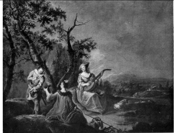
11. The Miles Master, Scene galante , oil on canvas, 40 x 50 cm. Whereabouts unknown.

Our last two additions to the Miles Master's oeuvre were presented simply as anonymous eighteenth-century pictures when they came up for sale. One is a painting that twice was on the Vienna market, each time attributed simply to a French master of the eighteenth century (fig. 10). 10 Although the composition is quite similar to the preceding ones, the subject is slightly different in that a number of the characters are fancily costumed—as a Turk, a Punchinello, and men as knights or martial gods in suits of armor. But if the subject is slightly unusual, the people's faces and lurching, inclined poses are unmistakable. The last picture, a composition with just three primary figures was on the Brussels market where it was presented as an anonymous work of the eighteenth century (fig. 11). 11 It too should be given to the Miles Master.