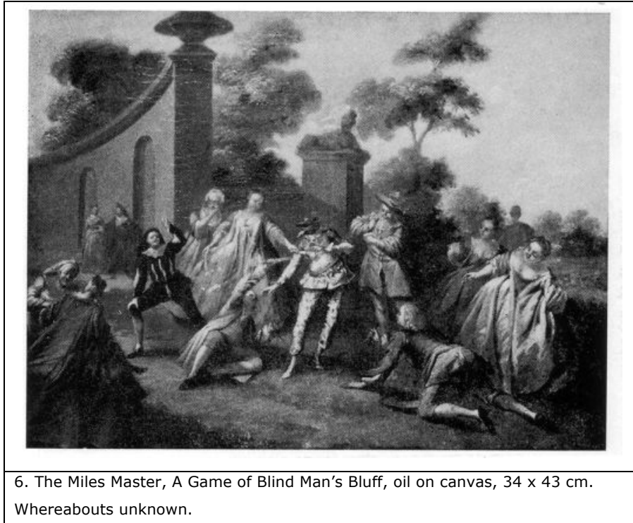
6. The Miles Master, A Game of Blind Man's Bluff , oil on canvas, 34 x 43 cm. Whereabouts unknown.

Another painting assignable to our Notname is a fête galante that appeared at auction in Brussels in 1968 with an improbable attribution to Watteau himself (fig. 6). 6 Like the painting owned by Roy Miles, this composition features a central grouping of figures, a small wedge of additional figures in darker tones at the left to create a repoussoir , and an opening to the distance at the right that creates a sense of depth. Almost all of the characters lean to one side or the other to simulate movement but they seem hyperactive rather than graceful. The high garden wall curves out dramatically, like the one in the Miles painting, to create another flaring accent in this already busy composition.